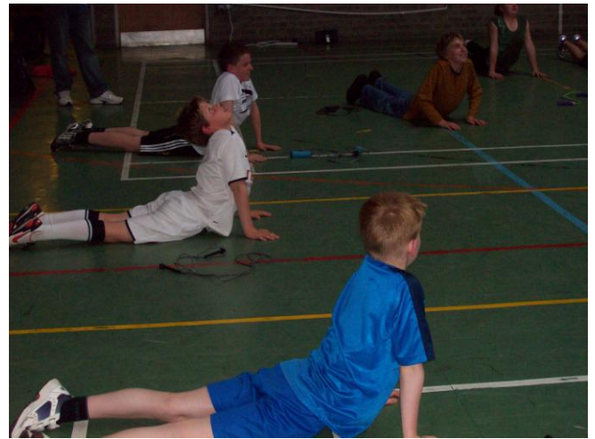
Hold that stretch!