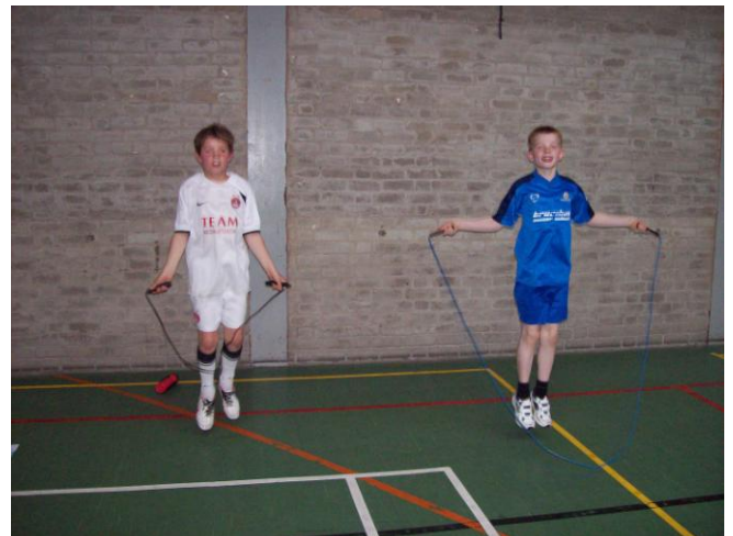
Skipping is a great exercise