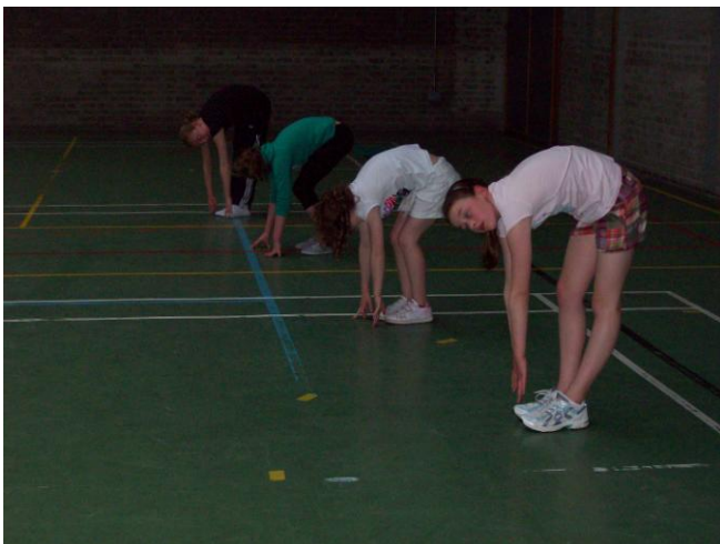
Yes we can touch our toes!...can you?