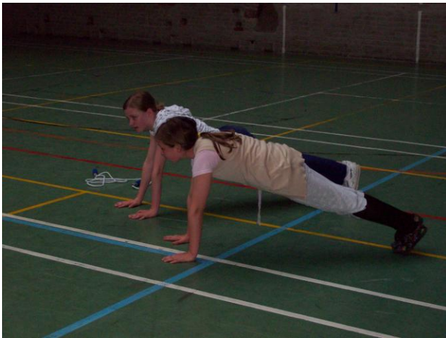
Surely we've held this for long enough!